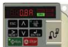
Figure 9: Motor Current

NOTE: Refer to the technical manual on how to access other drive monitors.