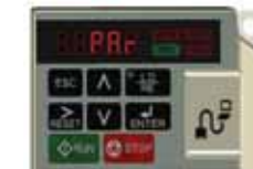
Figure 4: Select Parameter Value

Press ↓ four times until the digital operator shows the parameter menu (PAR) then press ENTER .