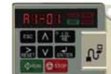
Figure 5: Select Parameter

Press → to select the digit you would like to change. Next use ↑ and ↓ to select the parameter group, sub-group, or number.