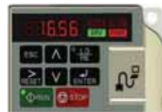
Figure 8: Output Frequency

Press ▲ until the FOUT LED turns on. The display now shows the actual drive output frequency in Hz.