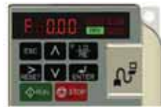
Figure 7: IMPULSE® G+ Mini Digital Operator Main Display

Press ▲ until the FOUT LED turns on. The display now shows the actual drive output frequency in Hz.