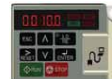
Figure 6: Change Parameter Value

Modify the parameter value using ↑ and ↓ . Press ENTER to save the new value.