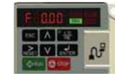
Figure 3: IMPULSE® G+ Mini Digital Operator Power-up State

Press ↓ four times until the digital operator shows the parameter menu (PAR) then press ENTER .